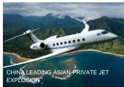
CHINA LEADING ASIAN PRIVATE JET EXPLOSION