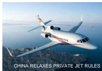
CHINA RELAXES PRIVATE JET RULES